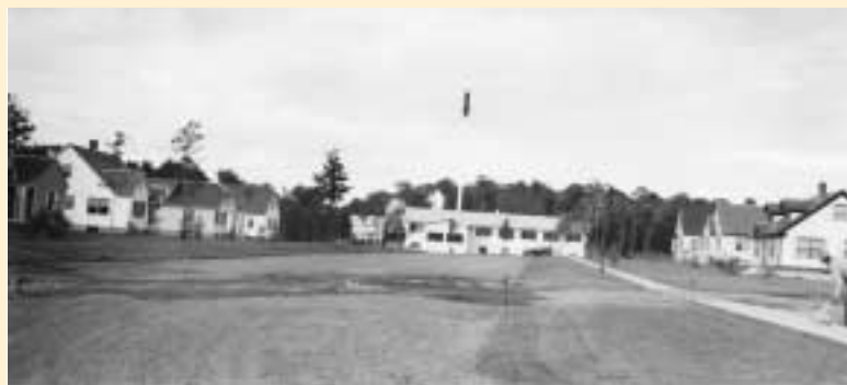
State Archives of Michigan